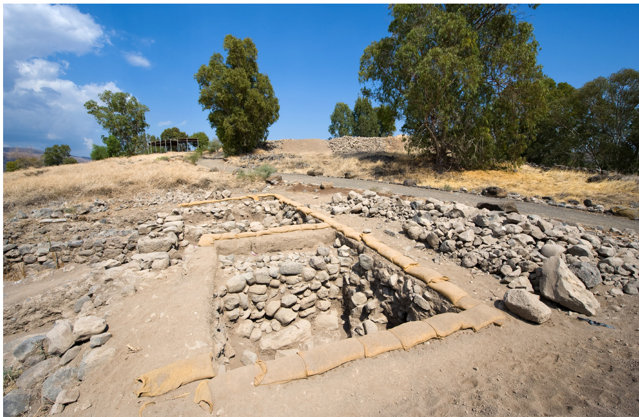
Ruines in Bethsaida.

The Palestinian Authority, which gained non-member observer state status at the United Nations in 2012,