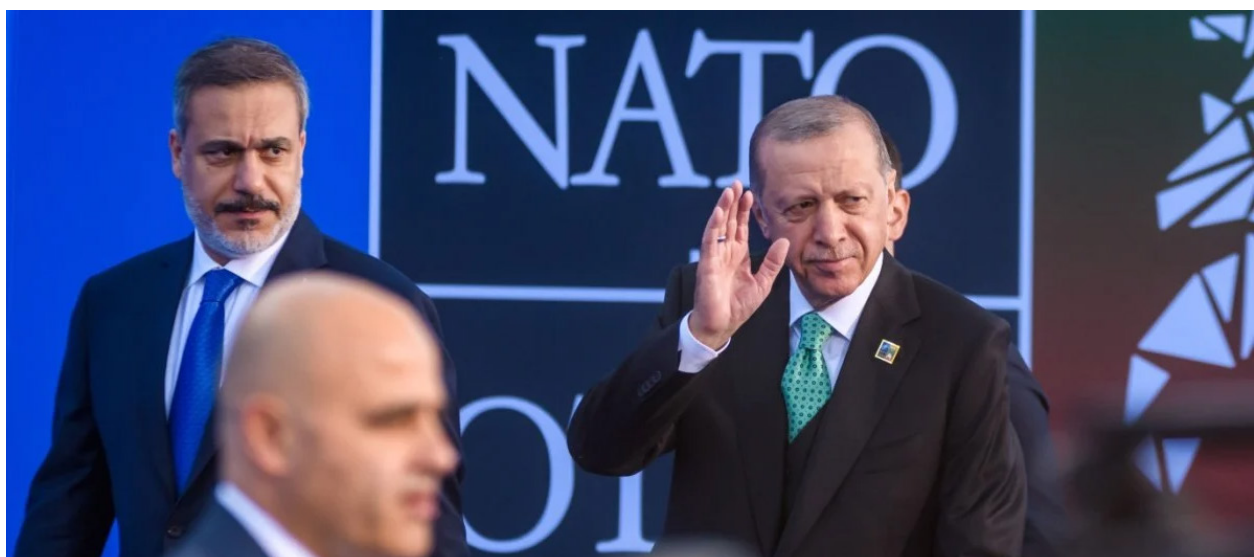
VILNIUS, LITHUANIA. 12th July 2023. Recep Tayyip Erdogan, President of Turkey, during NATO SUMMIT 2023 doorstep.

Likewise, Congress can continue to pressure Turkey to combat terrorism financing within its territory, including that of Hamas. The Financial Action Task Force (FATF), which sets global standards for combatting money laundering and terror finance, added Turkey to its "grey list" in 2021, deeming that Turkey has significant problems controlling its financial sector from abuse by nefarious actors. However, just last month, the FATF removed Turkey from the list. Congress should make the case for the FATF to return