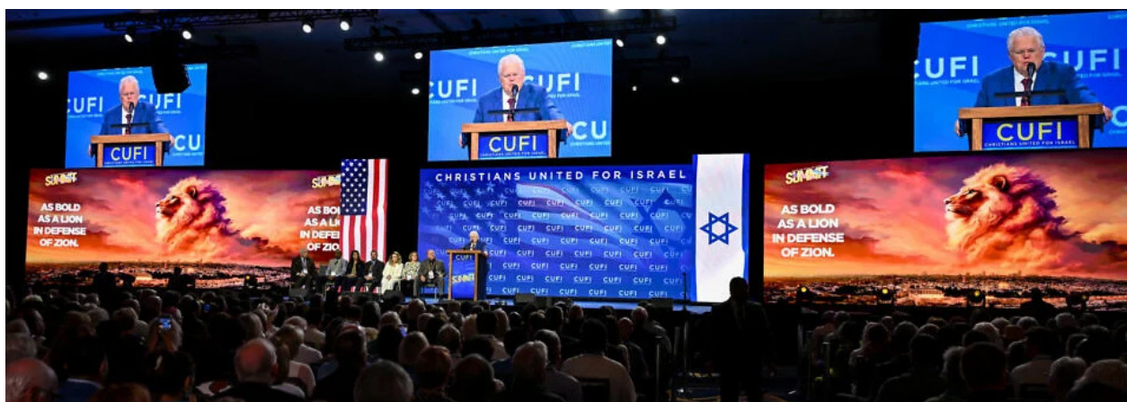
Pastor John Hagee addresses a conference of Christians United for Israel, National Harbor, Maryland, June 29, 2024.