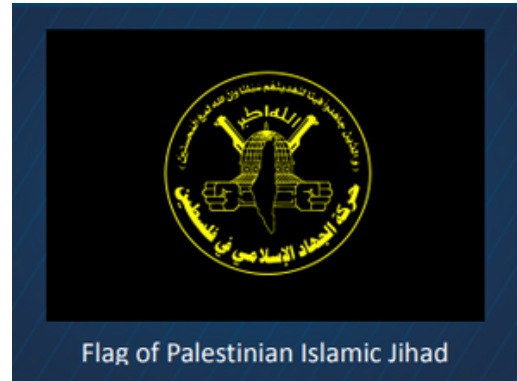
Flag of Palestinian Islamic Jihad

PIJ's operational arena is the Gaza Strip, and while that territory is controlled by Hamas, the two terror organizations share the goal of destroying Israel. Worse still, PIJ is generally thought of as even more radical than Hamas.