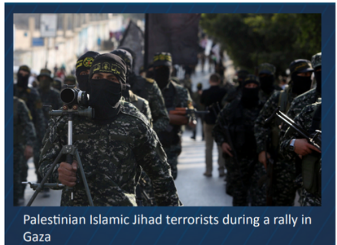
Palestinian Islamic Jihad terrorists during a rally in Gaza

PIJ’s vision for the region is the establishment of an Islamic State in all the land between the Mediterranean Sea and the Jordan River— including Israel, the West Bank, and the Gaza Strip; this state would be governed by Sharia (Islamic Law).