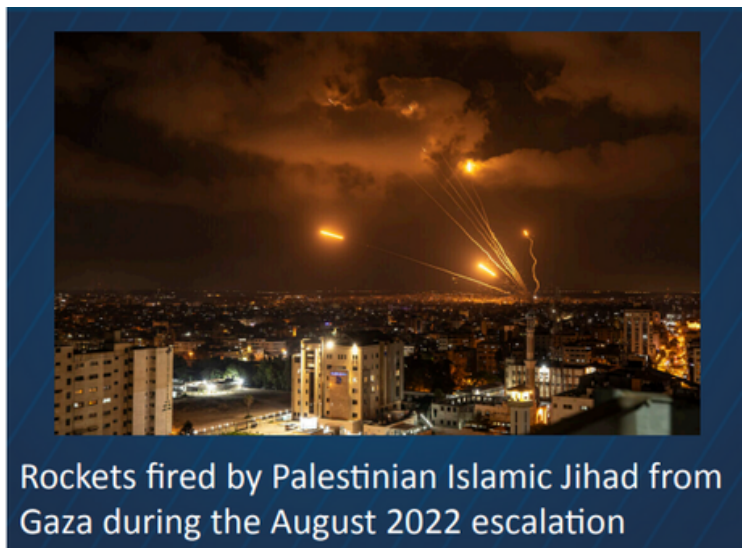
Rockets fired by Palestinian Islamic Jihad from Gaza during the August 2022 escalation

Since 2019 there has been an upsurge in violence orchestrated by Palestinian Islamic Jihad. From efforts to disrupt the Israeli elections and attempts to send bombers to the Israel-Gaza border fence, to sustained barrages of rockets at Israeli civilians, PIJ is becoming more prominent in Gaza. While this could be due to numerous factors, no doubt the internal rivalry with Hamas, PIJ's inclination to violent tendencies and orders from its Iranian masters, all play a role.