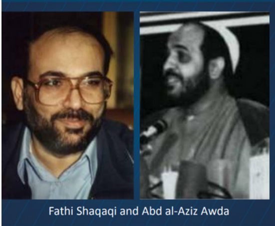
Fathi Shaqaqi and Abd al-Aziz Awda