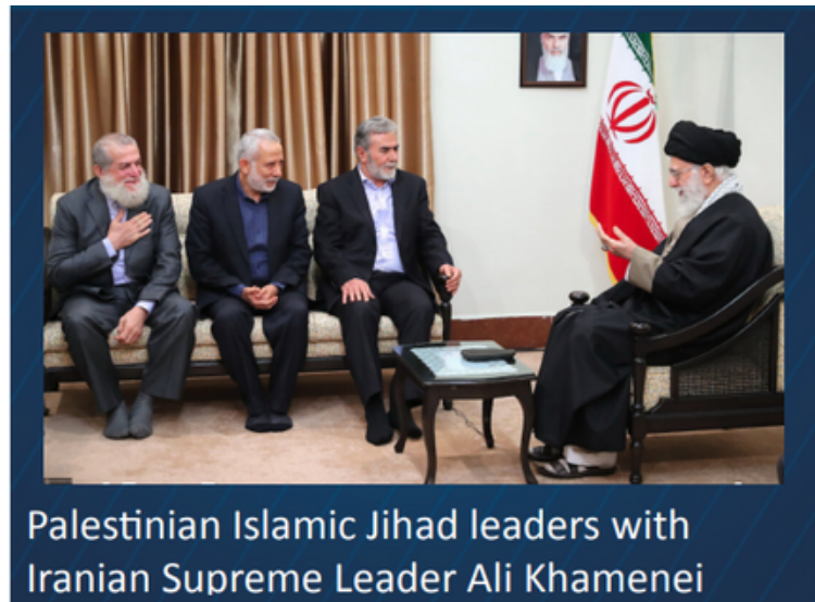
Palestinian Islamic Jihad leaders with Iranian Supreme Leader Ali Khamenei