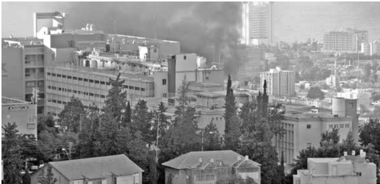
Kat्यूsha rocket fired from Lebanon hits a hospital in Haifa, Israel.

While Hamas carried out the attack, there can be little doubt they were planned and financed in Tehran.