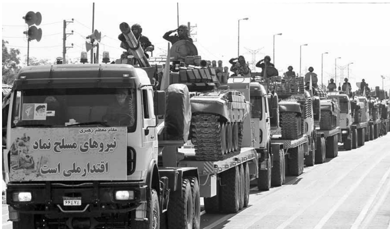
IRGC displays its main battle tank during parade.

Very early on, Iran's clerical regime had indicated its intention to export the teachings of the Iranian Revolution of 1979 to achieve similar results in Islamic and even non-Islamic countries. As the regime found little fertile ground for a Shia-led revolution in a largely Sunni Middle East, it pivoted to the use of terror and proxies to bring countries into its sphere of influence. In Yemen and Iraq, Iran's use of proxies has given Tehran enormous influence over those countries. Through Hezbollah, Lebanon is effectively under Iran's control. And Syria, for all intents and purposes, an Iranian client state. In fact, Syria's brutal dictator Bashar al-Assad remained in power through that country's recent years-long civil war as a direct result of Iranian support that included Hezbollah terrorists fighting in support of the Assad regime.