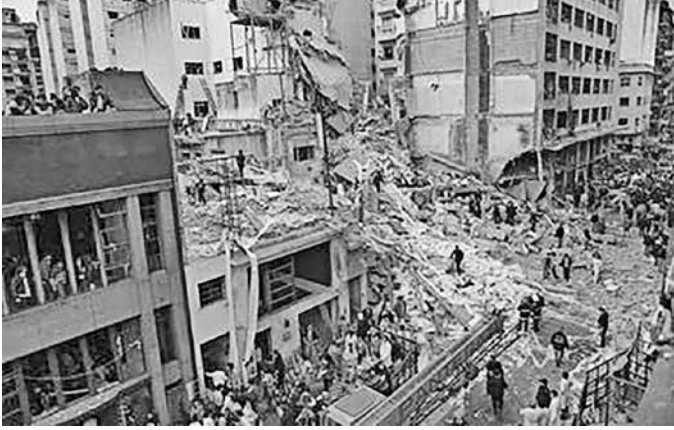
Aftermath of AMIA bombing in Buenos Aires.