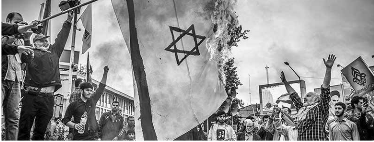
Iranians burning Israeli flag at an anti-Israel rally.

Ayatollah Khomeini harbored a deep hatred for Israel long before he came to power and that hatred remains a part of the regime's core ethos. Khomeini is reported to have said in a rather strange screed in 1963, "Israel wants there to be no Qur'an in Iran. Israel wants there to be no clerics in Iran. Israel wants there to be no Islam in Iran."