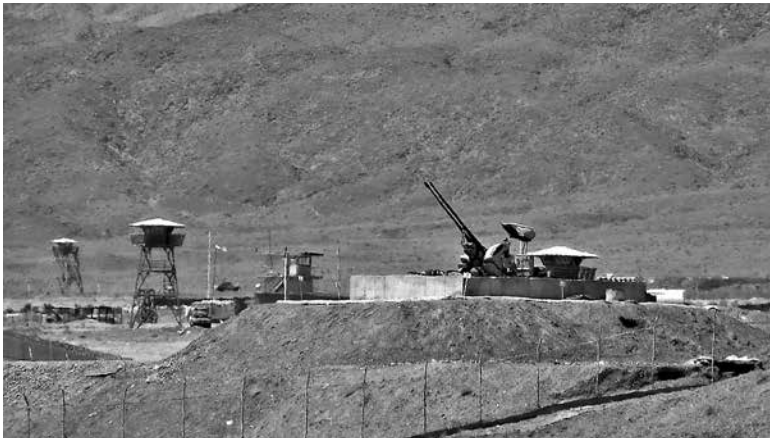
Anti-aircraft guns guarding Natanz Nuclear Facility, Iran.

Sadly, President Biden has not heeded these warnings. As of this writing, the current U.S. administration is in negotiations to restart the deal, but Iran continues to behave belligerently, demanding ever-increasing concessions from world powers and requiring the world look the other way on Iran’s illicit nuclear activities, support for terror, and abhorrent treatment of Iran’s citizens.