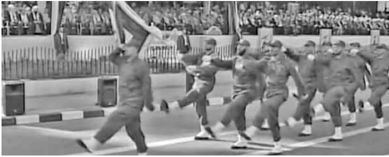
Hezbollah terrorist parade in Beirut.

Like other Islamic fundamentalists that emerged in the 20th century, Khomeini taught his followers that Jews were the embodiment of satanic evil in the world. He mixed a brand of radical Islamic antisemitism with elements of historical European antisemitism that accused Jews of heinous murder rituals, being a corrupting influence on society, and of sinister plots for world domination. This official policy of antisemitism and the destruction of Israel was passed on to Hezbollah as its divine mandate.