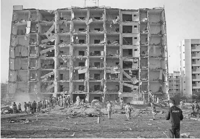
Aftermath of Khobar Towers bombing in Saudi Arabia.

was directed against Jews and took place a day after the AMIA in Buenos Aires. An expression of support was given by an affiliate of Hezbollah, “Ansar Allah,” in South America.