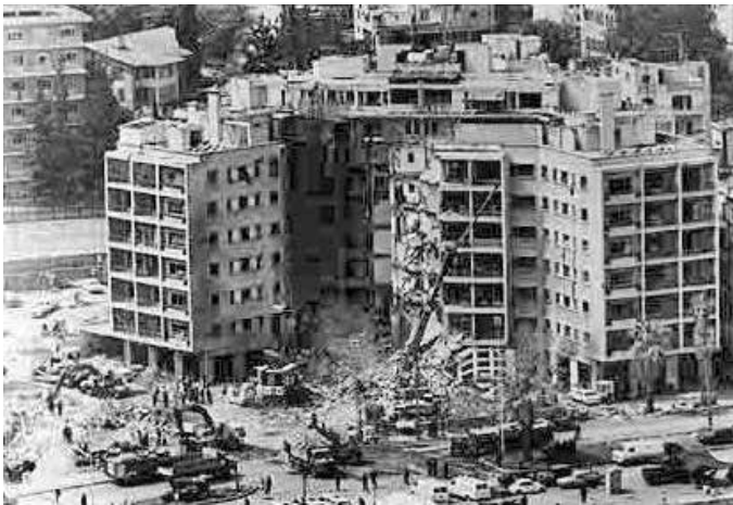
Aftermath of Beirut barracks bombing.

On April 18, 1983, a suicide bomber crashed a truck full of explosives into the front of the U.S. embassy in Beirut, Lebanon. The truck ended up detonating upon impact. The explosion killed 63 and wounded 120.