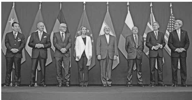
Foreign Ministers, including then-Secretary of State John Kerry, pose for photo with Iranian Foreign Minister Javad Zarif.

In subsequent years, world powers scrambled to bring Iran to the negotiating table as it insisted nuclear energy was its right, while Israeli figures pointed out that a nuclear Iran was a threat to the very existence of the Jewish state.