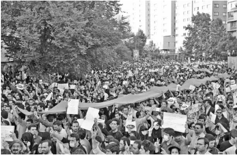
Pro-democracy protests in Iran.