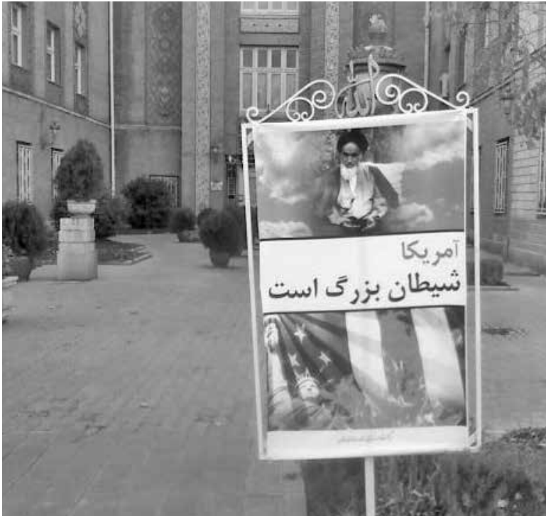
Banner of Ayatollah Ruhollah Khomeini denouncing America as the "Great Satan" at the Iranian Foreign Ministry in Tehran.

with the destruction of Israel remains high on its policy agenda, and as the possibility of Tehran obtaining a nuclear weapons capability looms ever closer, the danger to the free world that Iran presents is clear and present.