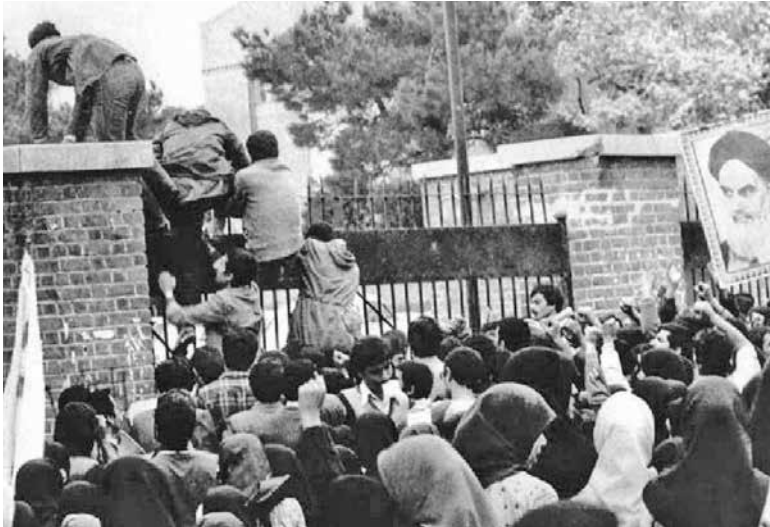
Iranian students breaching U.S. Embassy in Tehran.

vision for Iran was not pluralistic. He turned Iran into an Islamic republic in 1979, and clerics assumed political control under his leadership. Led by the now Supreme Leader Ayatollah Khomeini, Iran's reason and justification for existence immediately became attacking the West and democracy itself, all couched in a radical totalitarian interpretation of Islam.