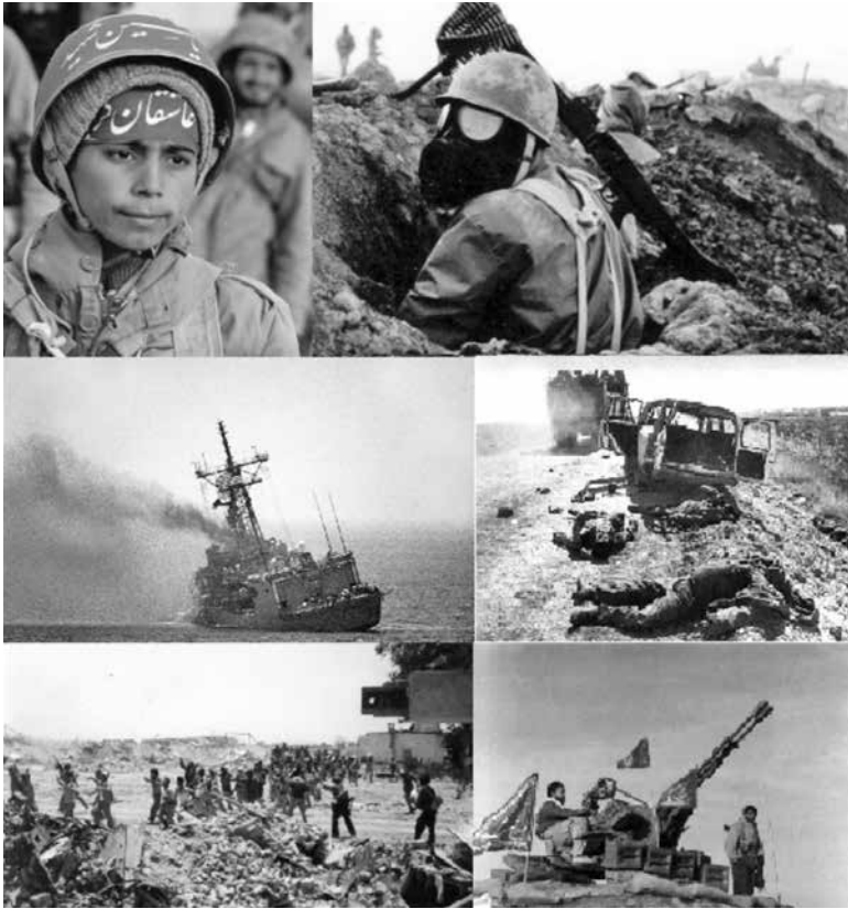
Selected images from the Iran-Iraq war.