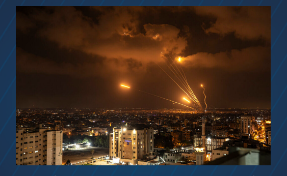
Rockets fired by Palestinian Islamic Jihad from Gaza during the August 2022 escalation

A fundamental element of the PIJ doctrine is that