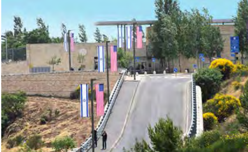
The US Embassy in Jerusalem.

President Trump's decision to move the US Embassy represented the fulfillment of a promise made by the American people to Israel more than 20 years earlier. This was a long-overdue correction in American foreign policy by recognizing Jerusalem as Israel's rightful capital.