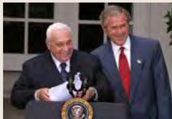
President George W. Bush and Prime Minister Ariel Sharon at a joint press conference in 2003.

The US-Israel relationship has been special from the beginning. From the founding of our country, when the Framers decided to build a new nation on the Judeo-Christian values of the Bible, America has been a safe haven for Jews who have been violently persecuted everywhere else in the world. American Christians were among the earliest believers in Zionism, based on their belief in the Bible as the Word of God.