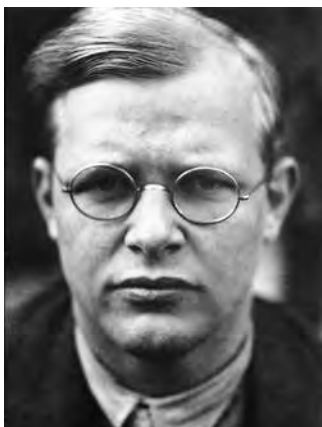
Dietrich Bonhoeffer, a German pastor and theologian.

Dietrich Bonhoeffer, a German pastor and theologian who gave his life for the protection of the Jewish people during Hitler's regime, has said famously,