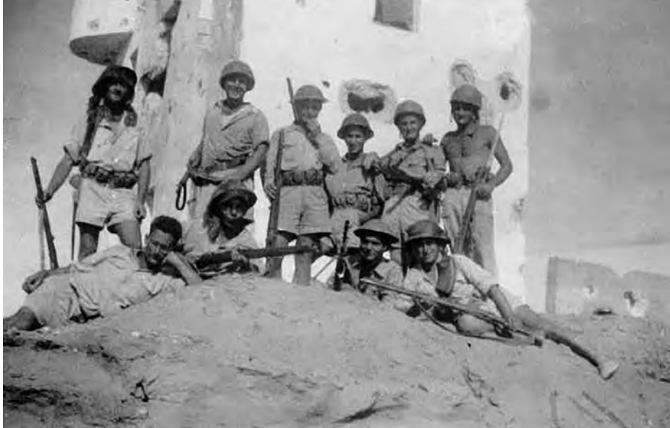
Israeli soldiers in Nirim during 1948 War of Independence.

Israel lost 6,373 people in the war, nearly one percent of its entire population.