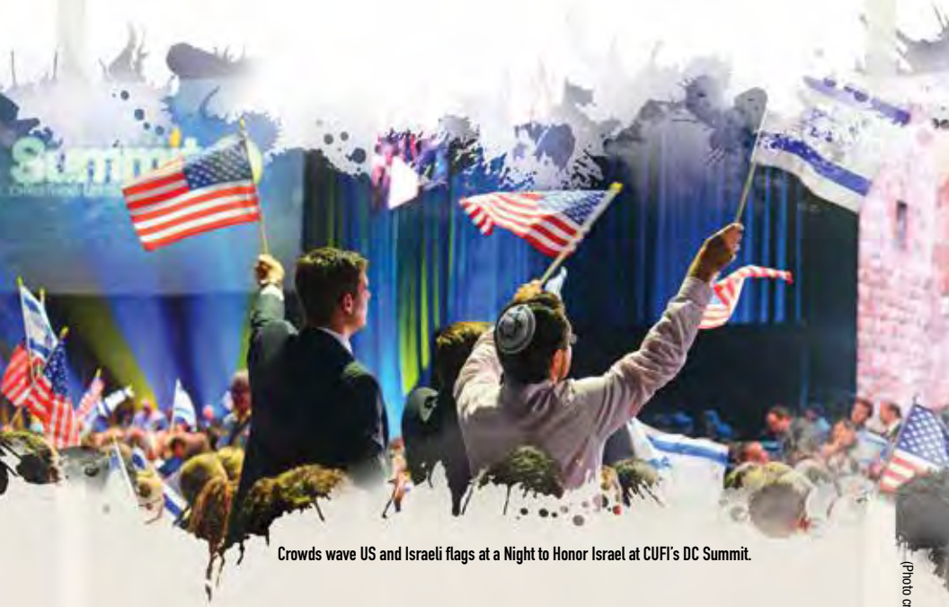
Crowds wave US and Israeli flags at a Night to Honor Israel at CUFI's DC Summit.