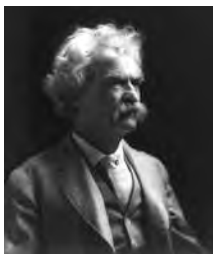
Portrait of Mark Twain.

“The Egyptians, the Babylonians and the Persians rose, filled the planet with sound and splendor, then faded to dream-stuff and passed away; the Greeks and Romans followed and made a vast noise, and they were gone; other people have sprung up and held their torch high for a time but it burned out, and they sit in twilight now, and have vanished.