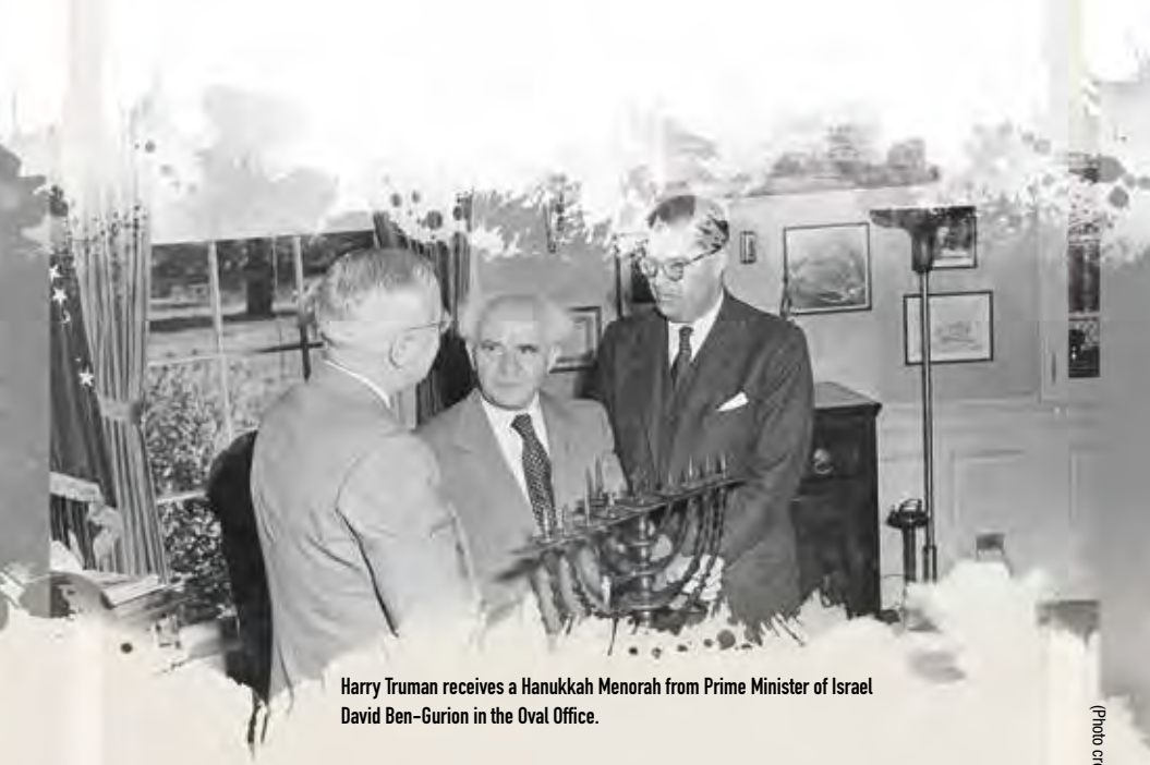
Harry Truman receives a Hanukkah Menorah from Prime Minister of Israel David Ben-Gurion in the Oval Office.