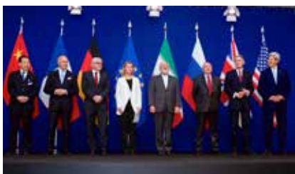
The ministers of foreign affairs of several countries announcing the framework for the Iran Deal in April 2015.