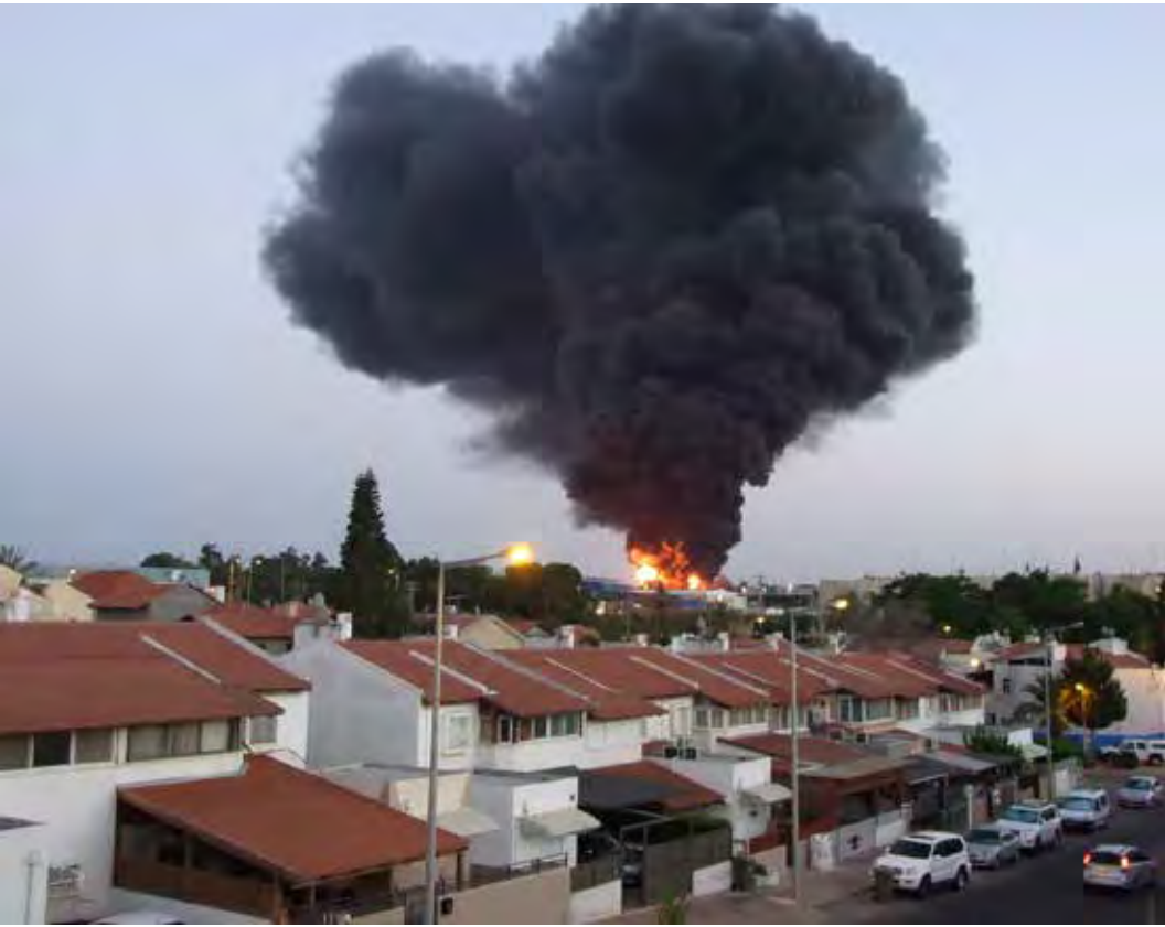
Factory in Sderot on fire after a rocket attack from Gaza.

none of their planned massacres succeeded, but the discovery of this new threat alarmed Israel. The tunnels had to be destroyed.