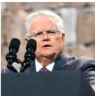
Pastor John Hagee speaks at CUFI's annual DC Summit.

Remember, “without Judaism, there would be no Christianity.” Paul understood this truth, which is why he tells his Gentile audience who had converted to Christianity that their faith was based on the legacy of the Jewish people. God’s relationship with the Jewish people is the foundation and bedrock of His relationship with the church.