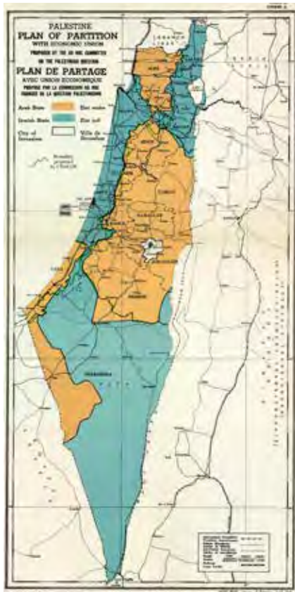
1956 Map of UN Partition Plan for Palestine, adopted in 1947.

state called Transjordan, and 23% for the Jewish people. 10