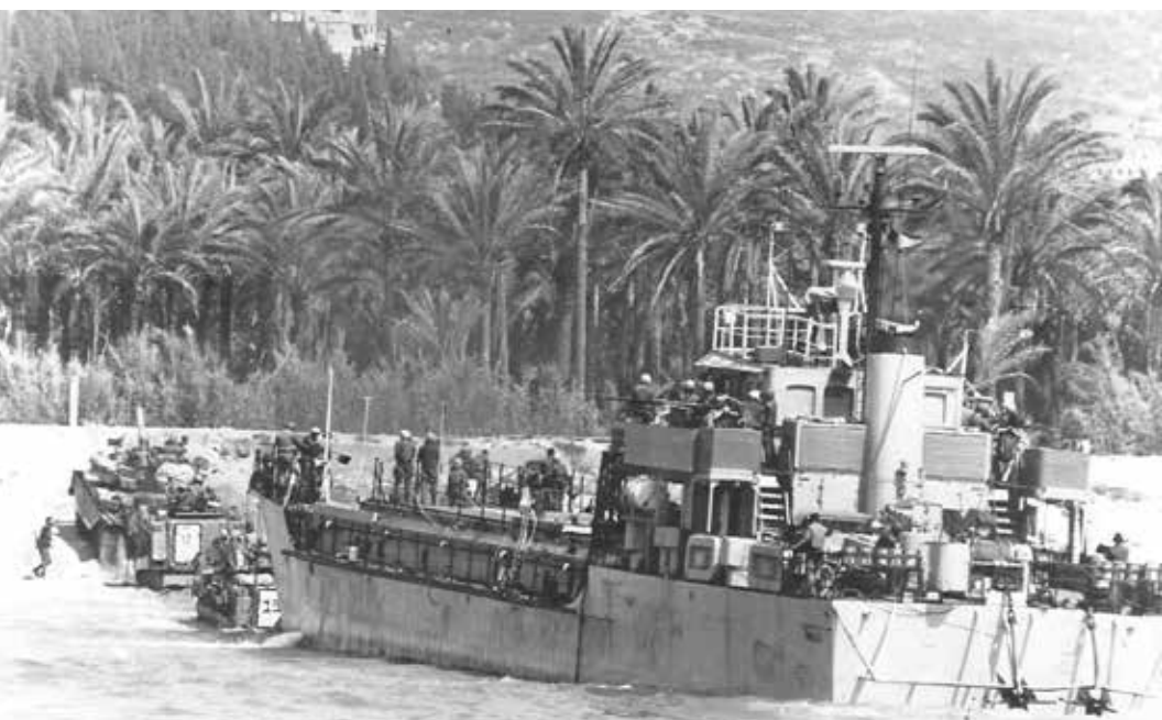
Israeli armored vehicles engaging in amphibious landing.

During the 1970s and 80s, the violent terrorist group known as the Palestinian Liberation Organization, led by Yasser Arafat, used their position within the villages of southern Lebanon