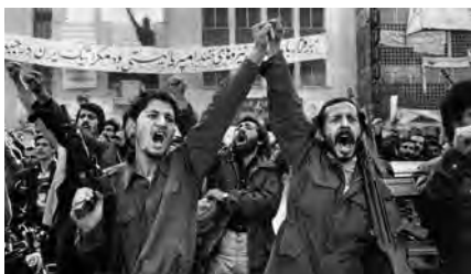
Two armed men during the Iranian Revolution.