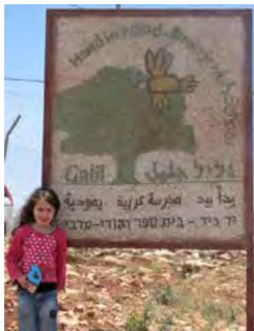
Little girl in front of Galil school, an Arab-Jewish primary school in Israel.

the rest of the Middle East this progress has stayed largely within urban areas and has not gained much traction.