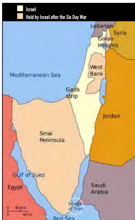
Map of land captured by Israel at the conclusion of the Six Day War.