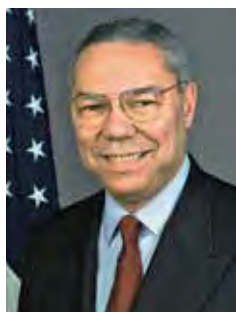
Official portrait of US Secretary of State Colin Powell.

“I know that you do not combat racism by conferences that produce declarations containing hateful language, some of which is a throwback to the days of “Zionism equals racism;” or supports the idea that we have made too much of the Holocaust; or suggests that apartheid exists in Israel; or that singles out only one country in the world--Israel--for censure and abuse.” 18