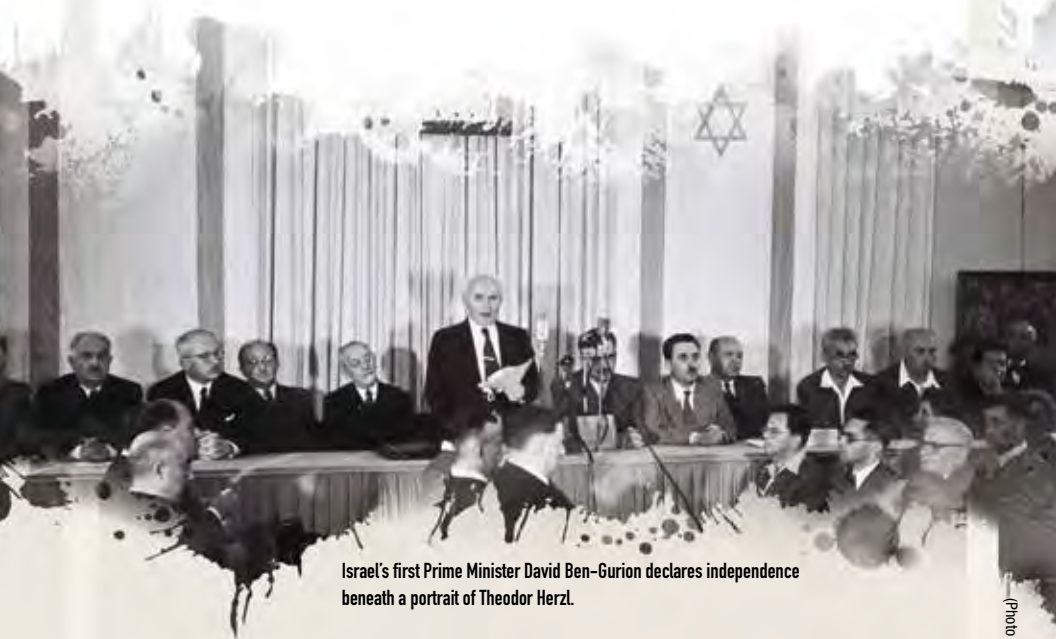
Israel's first Prime Minister David Ben-Gurion declares independence beneath a portrait of Theodor Herzl.