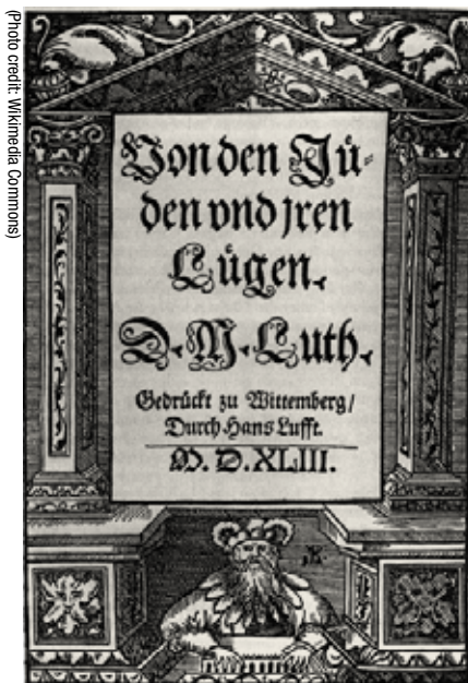
Title page of On the Jews and Their Lies by Martin Luther, 1543.

And so into this vacuum floods anti-Semitism, flowing straight out of the vile teachings articulated by numerous church fathers through the ages. Instead of loving the Jewish people deeply and fervently as God's very own—the church, as a whole, learned to hate them.