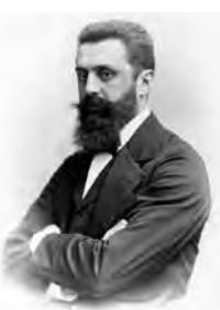
Portrait of Theodor Herzl.

After nearly two millennia in exile, in the late 19th and early 20th centuries, a new movement for Jewish sovereignty began to gain worldwide traction. In 1896, Theodor Herzl's Zionist pamphlet, The Jewish State , laid out a vision that would eventually culminate in the re-birth of the State of Israel. Herzl believed he had an answer to the never-ending problem of anti-Semitism and persecution faced by Jewish people wherever they went throughout history: