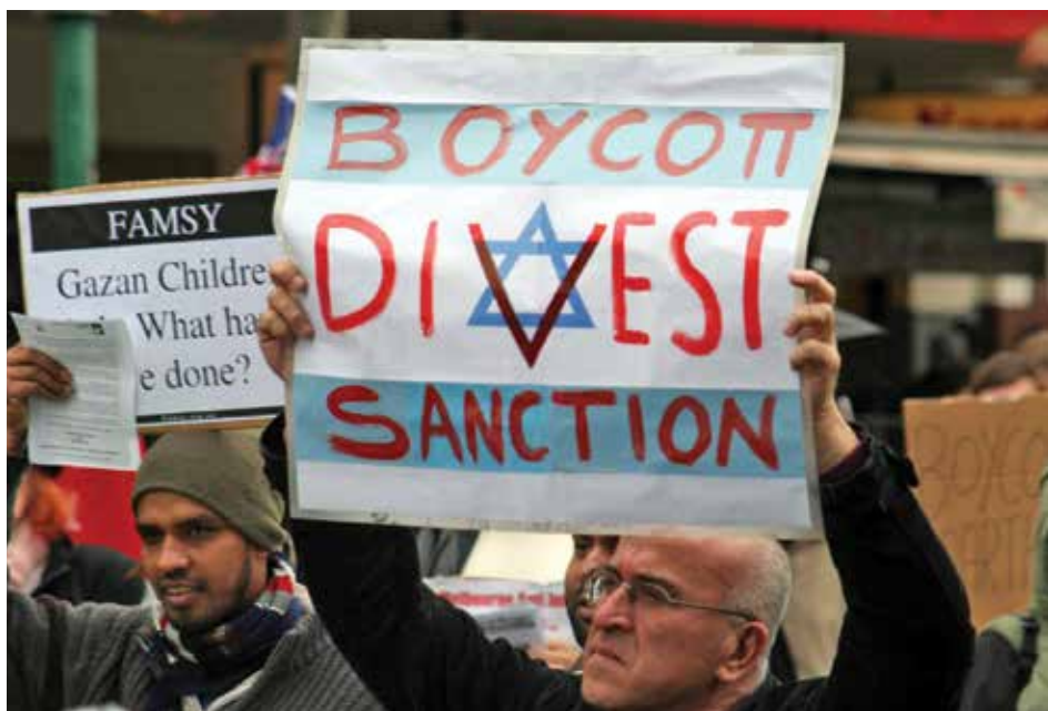
BDS protest in Melbourne, Australia.

This movement is especially active on college campuses, where young people are presented with a false narrative by individuals appropriating the lexicon of the civil rights and social