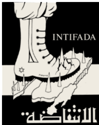
Poster by Ayman Bardaweel in 1990 portraying Israel as an oppressor.

Thousands of people were injured or killed over the next four years. What had started as spontaneous mob violence was soon orchestrated and encouraged by the PLO, led by Yasser Arafat.