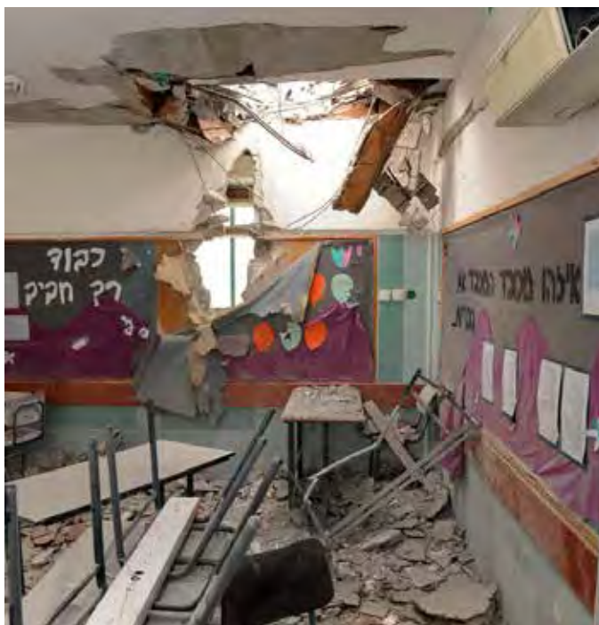
Kindergarten classroom in Beer Sheva, Israel after being hit by a rocket from Gaza.

The desire to eradicate Israel in the 20th century fueled the rise of several Islamic extremist factions. Fundamental to each of these terrorist groups was an anti-Semitic interpretation of Islamic theology that left no room for acceptance of the state of Israel, the Jewish people and consequently the possibility for peace.