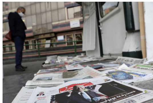
The atomic enrichment facilities Natanz nuclear power plant, some 300 kilometres south of capital Tehran, November 4, 2019

The Islamic Republic's human rights abuses, support for terror, and missile programs must all be addressed in potential discussions with Iran. Contrary to Biden's premise that the current JCPOA is a starting point for "follow-on" agreements, the nuclear issue cannot be compartmentalized, even at the outset of engagement. Such a path would enable Tehran to drag its heels on all other issues. If the nuclear issue is compartmentalized, the regime would undoubtedly continue its blood-soaked domestic and foreign policies.