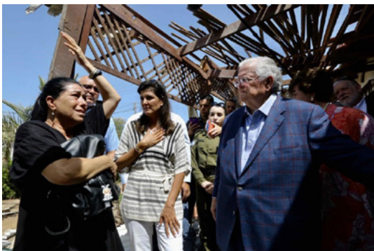
Former U.S. Ambassador to the United Nations Nikki Haley and CUFI founder and Pastor John Hagee tour damage to Israeli homes after Hamas launched thousands of rockets into Israel last month, June 2021.

"Certainly, not all Democrats have been against Israel but it seems like it's growing ... their voices are getting louder," she said, adding that Biden is appeasing the extremists in his party. "You call out hate every time you see it, regardless of who says it and you hold them accountable."