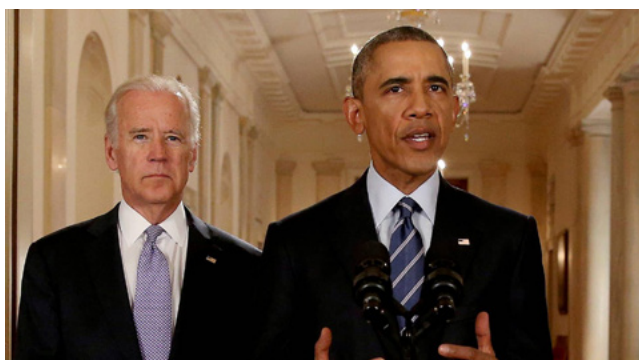
U.S. President Barack Obama with Vice President Joe Biden alongside delivers a statement about the nuclear deal with Iran and six major world powers at the White House in Washington. July 14, 2015

As published in Haaretz (December 9, 2020)