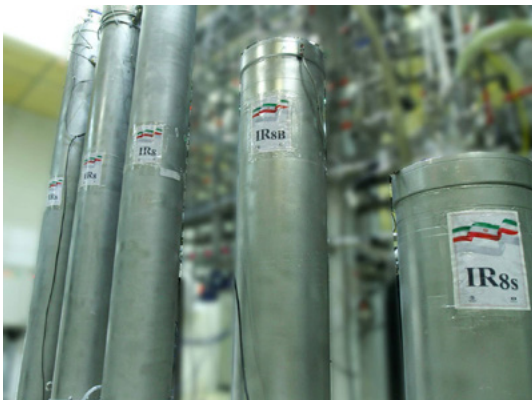
The atomic enrichment facilities Natanz nuclear power plant, some 300 kilometres south of capital Tehran, November 4, 2019

Likewise, Jake Sullivan, Biden's pick for National Security Advisor noted that a Biden administration would seek, "to negotiate a follow-on agreement that does materially advance the security of the United States, of Israel and of our other regional partners as well." Even Biden in the aforementioned op-ed noted that the current agreement would be "a starting point for follow-on negotiations."