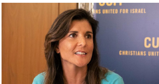
Nikky Haley.

Hagee and Haley also stressed the importance of confronting Iran, noting that it supports Hamas and other terror groups in the region. (Hours after the May 21 ceasefire, Hamas leader Ismail Haniyeh thanked Iran for its financial and military assistance during the conflict.)