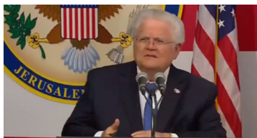
Christians United for Israel founder and chairman Pastor John Hagee delivering the benediction at the opening of the U.S. embassy in Jerusalem on May 14, 2018.

With 2021 marking CUFI's 15th anniversary, the organization says that it continues to grow rapidly despite challenges brought on by the coronavirus pandemic.