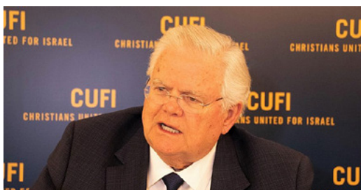
Pastor John Hagee.

Haley sharply criticized U.S. President Joe Biden for attempting to return to the Joint Comprehensive Plan of Action (JCPOA), the 2015 nuclear deal that former President Donald Trump withdrew from in May 2018.