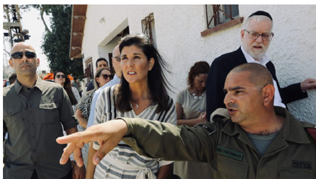
Former U.S. Ambassador to the United Nations Nikki Haley and CUFI founder and Pastor John Hagee in Israel, June 2021.

As published in The Jewish News Syndicate (June 26, 2021)