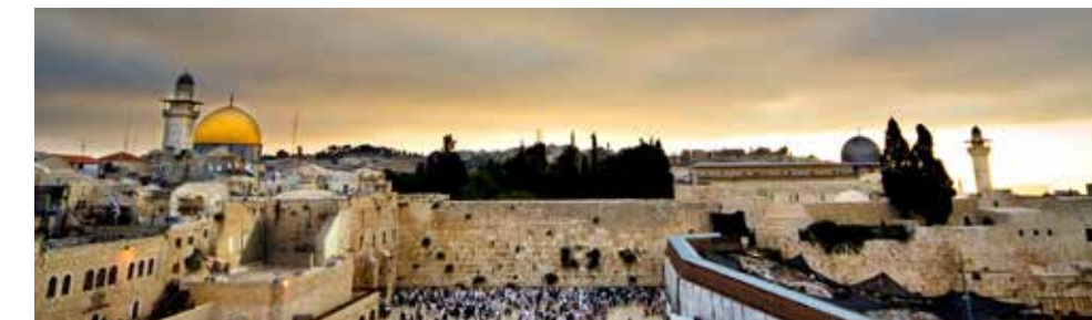
CUFI is America's "largest and most dependable pro-Israel group." - The Washington Post

Over the past 14 years, CUFI played a leading role in efforts to curb Iran's nuclear ambitions, hinder Hezbollah and Hamas's war of terror against Israel, strengthen the Jewish state's ability to defend itself, and defend Israel against the anti-Semitic BDS movement. And we've only just begun.